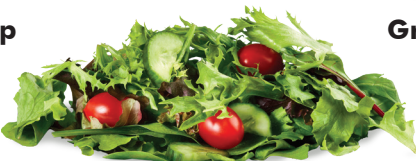
House Salad Spring mix, cucumber, cherry tomatoes

Assortment of mini danishes, cookies, cinnamon buns, sliced cake